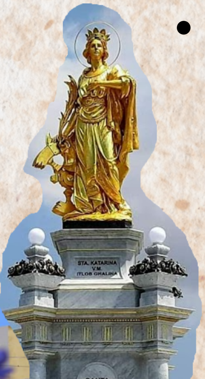
St. Catherine of Alexandria